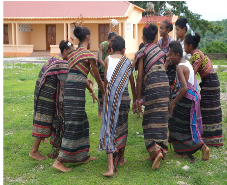
Tutuala dance group